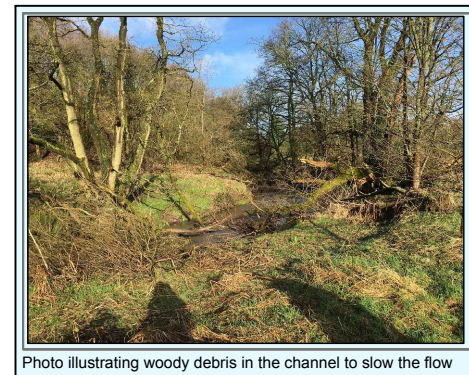
Photo illustrating woody debris in the channel to slow the flow