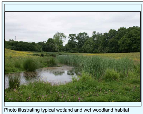
Photo illustrating typical wetland and wet woodland habitat