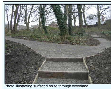
Photo illustrating surfaced route through woodland