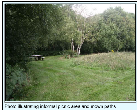
Photo illustrating informal picnic area and mown paths