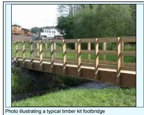
Photo illustrating a typical timber kit footbridge